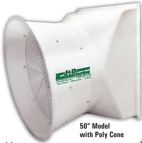
50" Model with Poly Cone